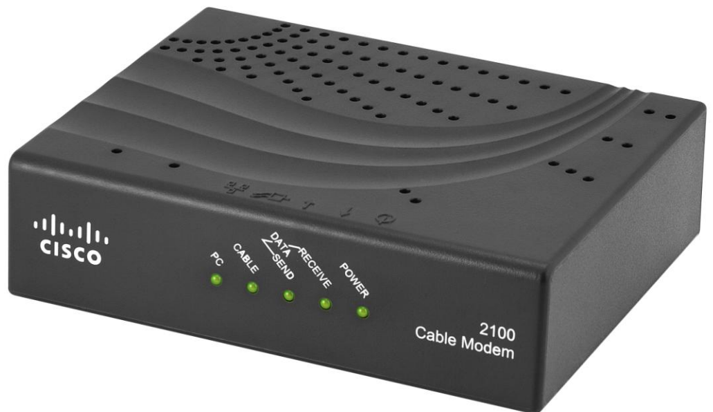
Figure 1. Cisco Model EPC2100 EuroDOCSIS 2.0 Cable Modem (image may vary from actual product and specification)

The EPC2100 also features WebWizard, a browser-based user interface. WebWizard is a powerful tool that facilitates installation and troubleshooting, and eliminates the need to load setup software on the customer premises equipment (CPE). The EPC2100 also features five front-panel LED status indicators that provide visual feedback of real-time data transmission and operational status.